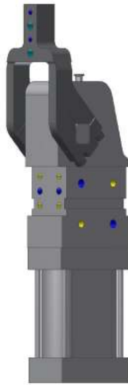
Clamp arm position 2: „Clamp type2“ 40 A10 ...2 50 A10 ...2 63 A10 ...2 80 A10