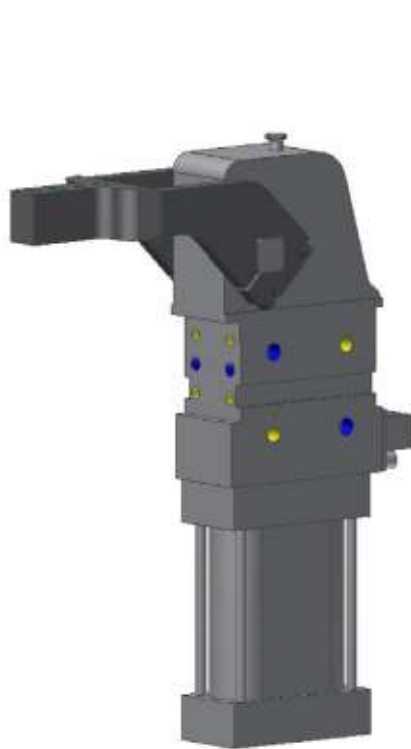
Clamp arm position 1: „Clamp type“ 40 A10 ... 50 A10 ... 63 A10 ... 80 A10